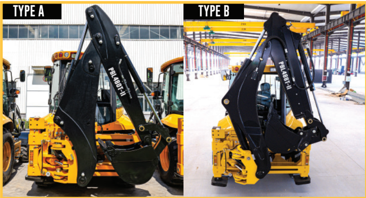
Different Backhoe Boom options are available.