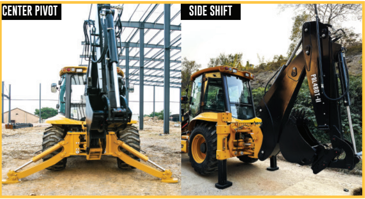
Stabilizer Arms are available in different types to suit your requirement.