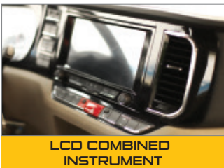
LCD COMBINED INSTRUMENT