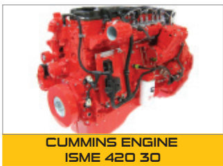
CUMMINS ENGINE ISME 420 30