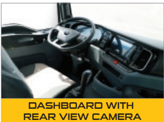
DASHBOARD WITH REAR VIEW CAMERA