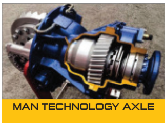
MAN TECHNOLOGY AXLE