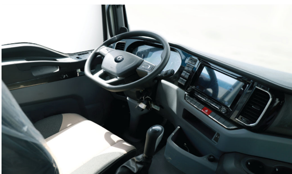
DASHBOARD WITH REAR VIEW CAMERA