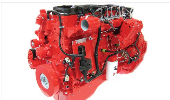
CUMMINS ISME 385 30 ENGINE