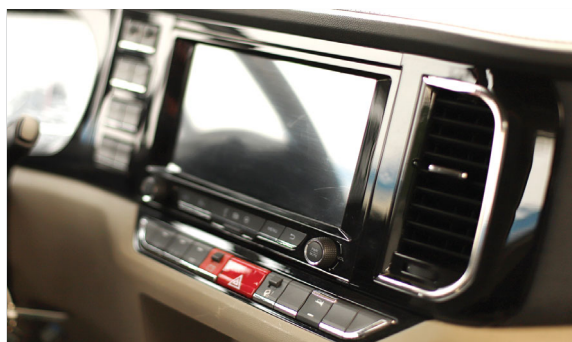
LCD COMBINED INSTRUMENT