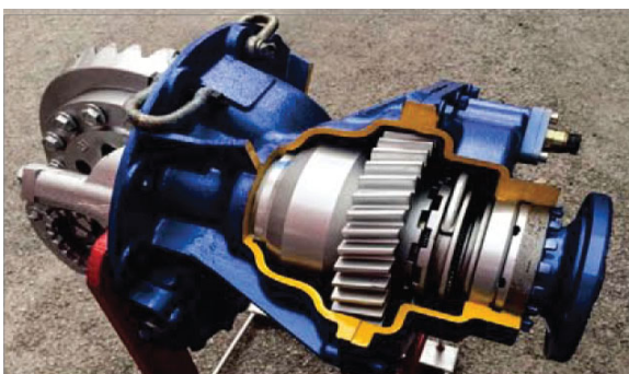
MAN TECHNOLOGY AXLE