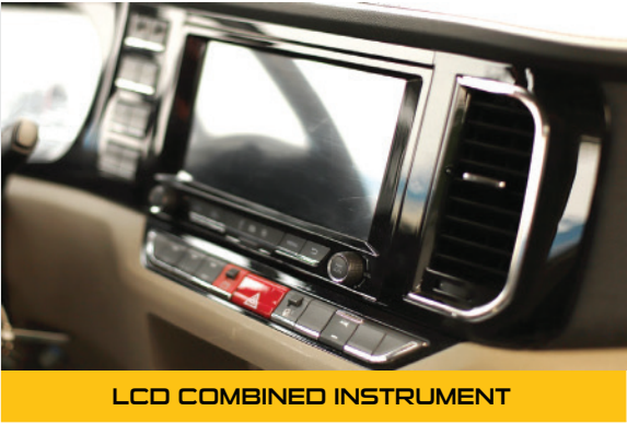
LCD COMBINED INSTRUMENT