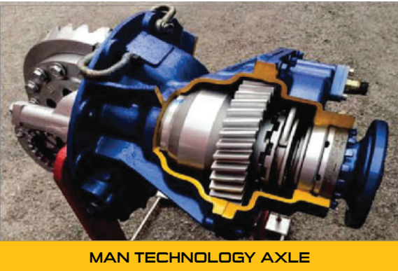
MAN TECHNOLOGY AXLE