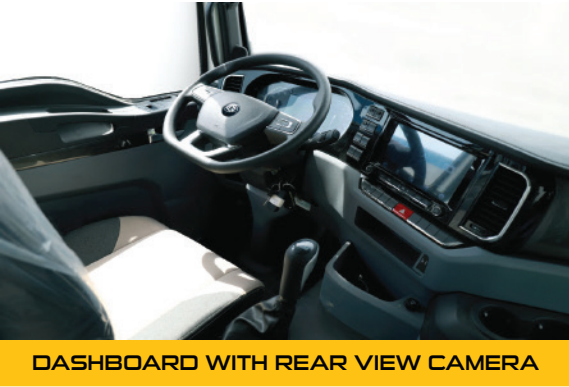
DASHBOARD WITH REAR VIEW CAMERA