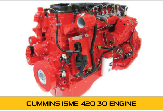
CUMMINS ISME 420 30 ENGINE